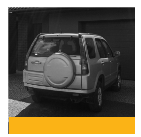
If you need to warm up your vehicle, move it outside. It is not safe to leave your vehicle engine running inside the garage, even if the garage door is open.