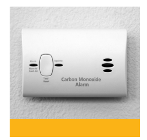
Install carbon monoxide (CO) alarms and test alarms every month.

Make sure there is a working CO alarm on every level of your home, especially near bedrooms and sleeping areas.