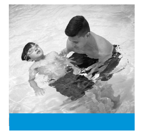
Enroll children in swim lessons. Every child is different, so teach children how to swim when they are ready. Consider their age, development and how often they are around water.

Watch children when they are in or near water. Keep young children and inexperienced swimmers within arm's reach of an adult. Make sure more experienced swimmers are with a partner every time.