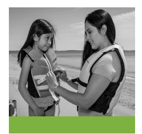
Teach children that swimming in open water is different from swimming in a pool. Potential hazards such as limited visibility, depth, uneven surfaces, currents and undertow can make swimming in open water more challenging than swimming in a pool.