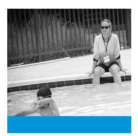
Be a Water Watcher. When there is more than one adult present, choose one to be responsible for watching children in and near the water for a certain period of time, such as 15 minutes. After 15 minutes, select another adult to be the Water Watcher.