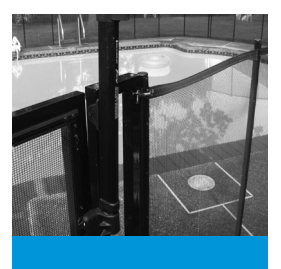
Install fences around home pools. Pool fences should surround all sides of the pool and be at least 4 feet tall with a self-closing and selflatching gate. Remember to empty kids' pools after use and store them upside down.