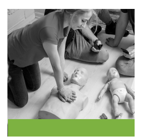
Know what to do in an emergency. Learn CPR and basic water rescue skills – it may help you save a child's life.